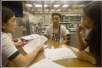
First Orientation/Interview for Class 6 Applicants October 12-13, 2018