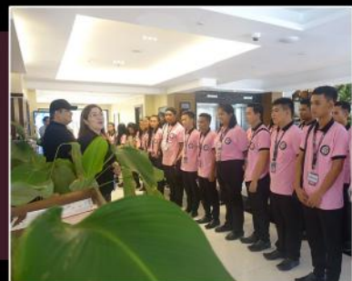
Best Western Bendix Hotel Facility Tour City of San Fernando, Pampanga September 18, 2018