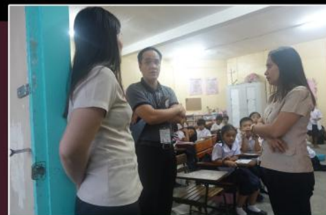
Primary Schools Ocular Visit in Preparation for the Special Facility Development Program Dungan Elementary School Canidha Elementary School Mamatitang Elementary School Sta. Maria Elementary School Pila Elementary School September 25-26, 2018