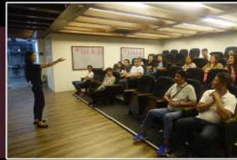
Second Orientation/Interview for Class 6 Applicants October 20, 2018