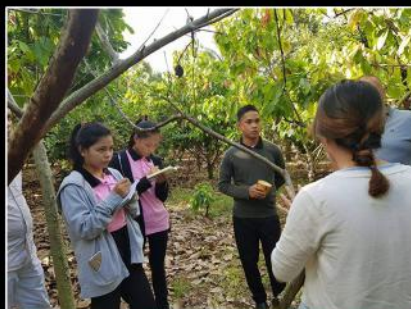
Cacao Farm and Chocolate Educational Tour (LRN Video Filming) Davao City October 11-12, 2018