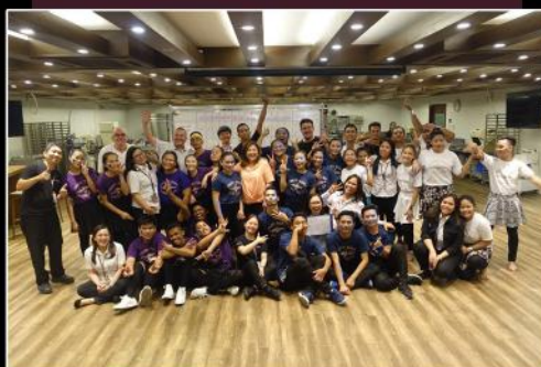
Class 5 Mini Sportsfest October 26-27, 2018