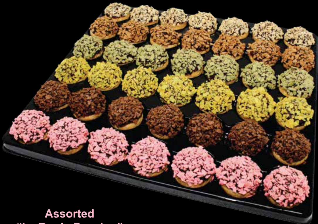
Assorted “La Boule Passion” 42pcs/tray