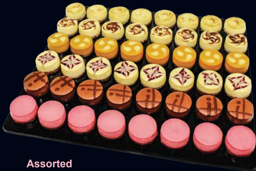
Assorted "Petit Cheese Cakes" 48 pcs/tray