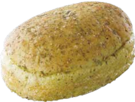
Spinach & Onion 98g / 3.46oz/pc.