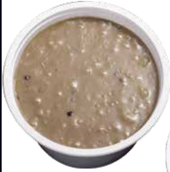
Whole Wheat Banana