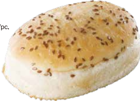
Linseed 98g / 3.46oz/pc.