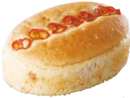
Tomato 100g / 3.53oz/pc.